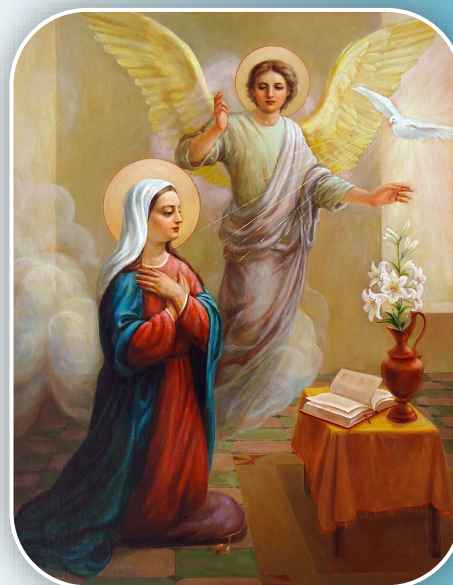
Annunciation To The Blessed Virgin Mary - Nov 25th