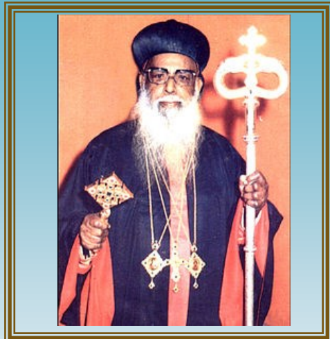
Feast of H. H. Baselios Marthoma Mathews I on Nov 8 th Thursday